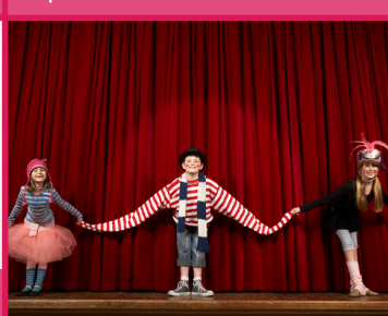
Take a bow at the end