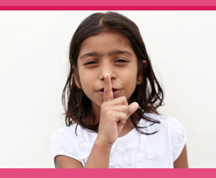
Be silent at the beginning and at the end of performance