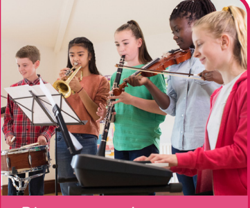
Play at the same speed and volume